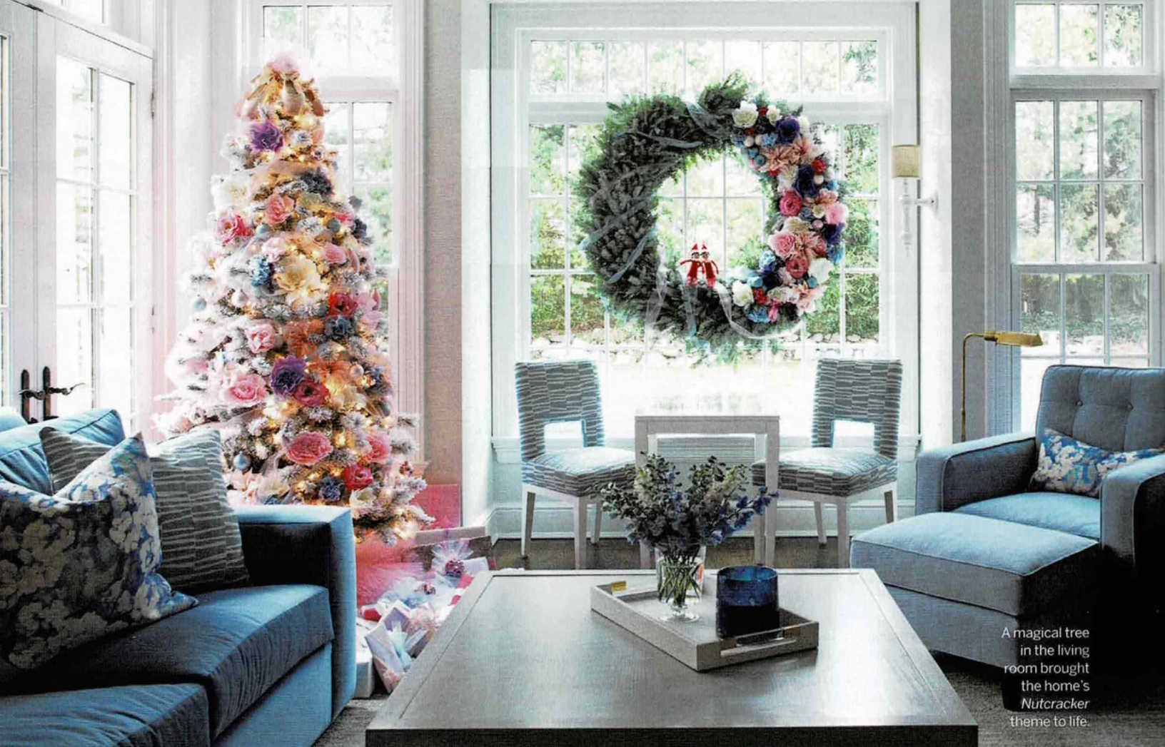
A magical tree in the living room brought the home's Nutcracker theme to life.