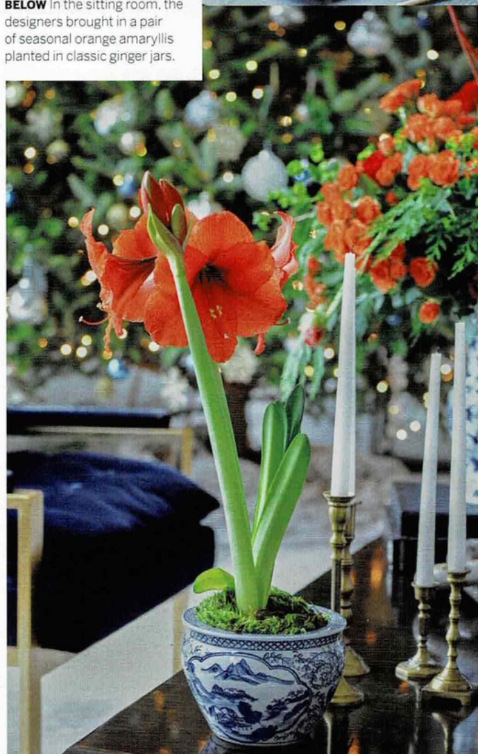
BELOW In the sitting room, the designers brought in a pair of seasonal orange amaryllis planted in classic ginger jars.