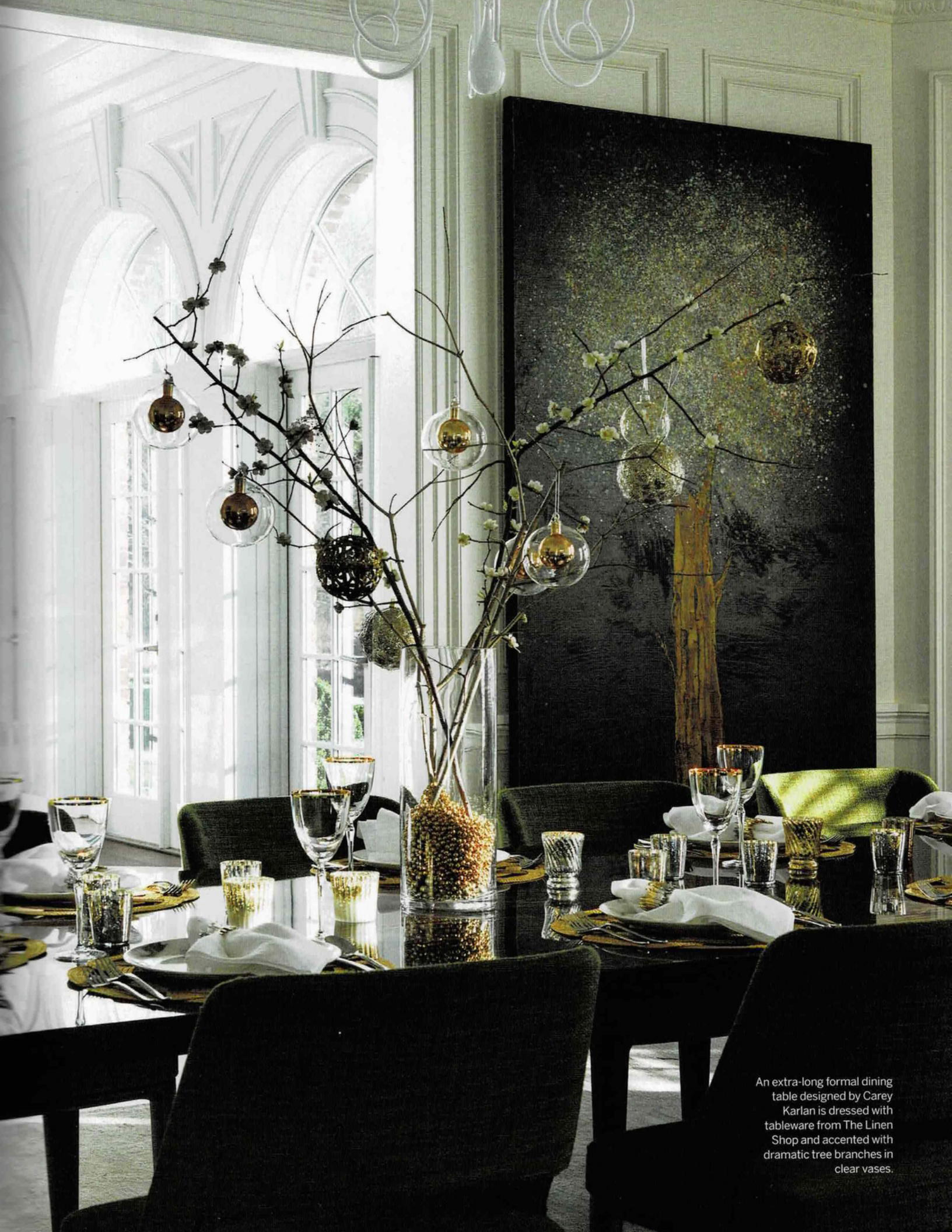
An extra-long formal dining table designed by Carey Karlan is dressed with tableware from The Linen Shop and accented with dramatic tree branches in clear vases.