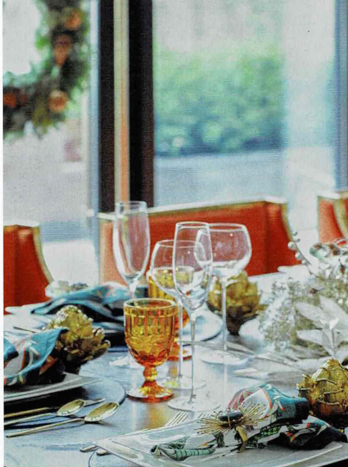
ABOVE King and Jackson chose elegant tableware in non-traditional holiday colors.

“Use live greenery or flowers to add a dramatic or surprising element to your holiday decor.”